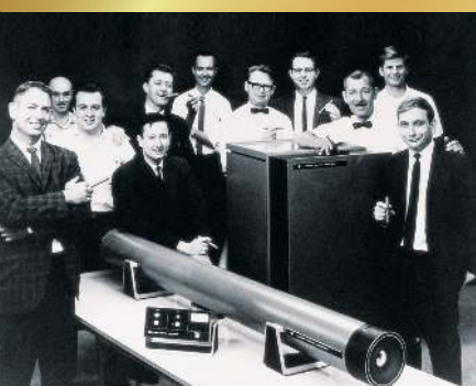
1970: Lumenis (previously Coherent) introduces the first argon laser photocoagulator in ophthalmology.