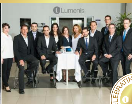
2016: Lumenis proudly launches the new retinal care portfolio, starring the Smart 532™, green photocoagulator with SmartPulse™.