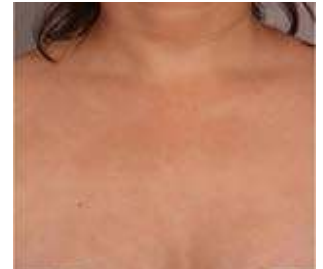
Treatment with Q-Switched Nd:YAG