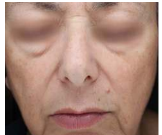
Photofractional™ treatment (Sequential treatment of IPL + ResurFX™) In-house clinic