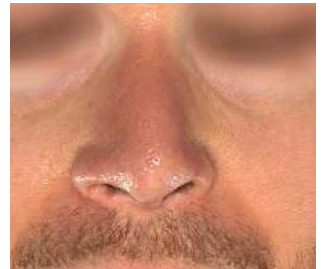
After 3 treatments